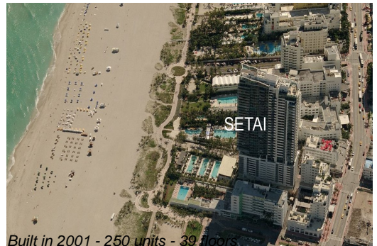
Built in 2001 - 250 units - 39 floors