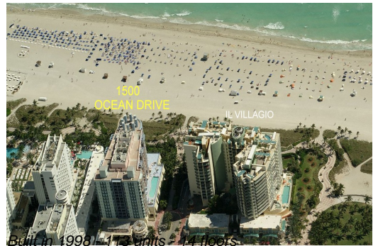
Built in 1998 - 113 units - 14 floors