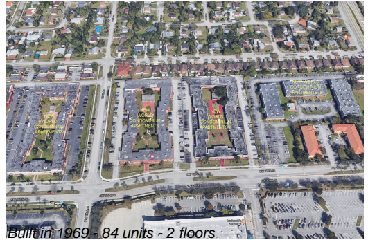
Built in 1969 - 84 units - 2 floors