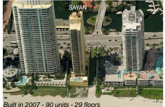
Built in 2007 - 90 units - 29 floors