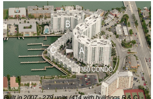
Built in 2007 - 279 units (414 with buildings B & C) - 15 floors