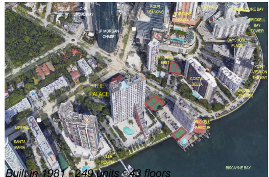
Built in 1981 - 249 units, 44 floors