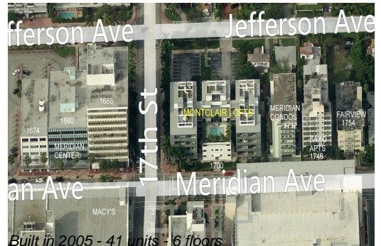
Built in 2005 - 41 units - 6 floors