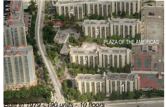
Built in 1979 - 190 units - 10 floors