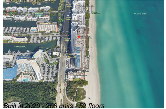
Built in 2020 - 208 units - 52 floors