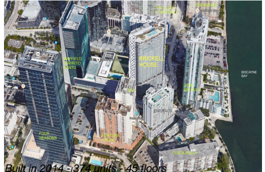
Built in 2014 - 374 units - 45 floors