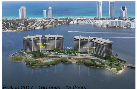
Built in 2017 - 160 units - 15 floors