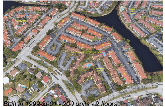
Built in 1999-2001 - 200 units - 2 floors