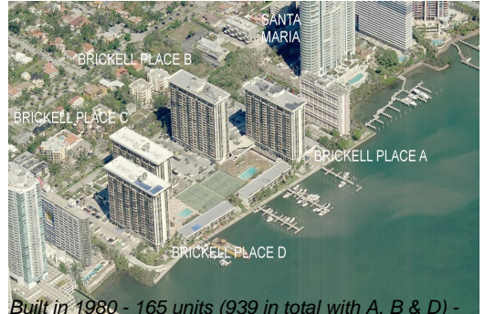
Built in 1980 - 165 units (939 in total with A, B & D) - 18 floors