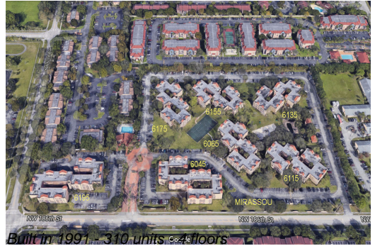
Built in 1997 - 310 units - 2-4 floors