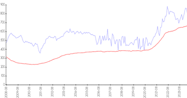
Icon 1 (North Tower) vs Miami

Icon 1 (North Tower): $782/sq. ft. Miami: $669/sq. ft.