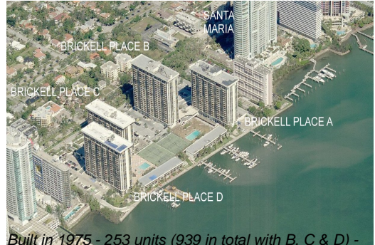
Built in 1975 - 253 units (939 in total with B, C & D) - 23 floors