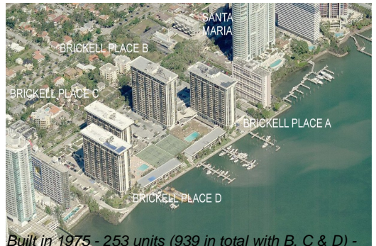
Built in 1975 - 253 units (939 in total with B, C & D) - 23 floors