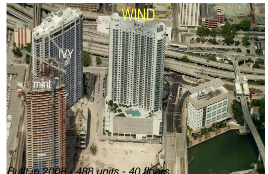
Built in 2008 - 488 units - 40 floors