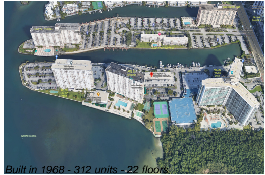
Built in 1968 - 312 units - 22 floors