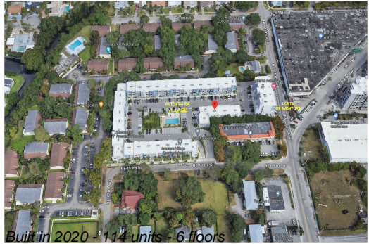
Built in 2020 - 114 units - 6 floors