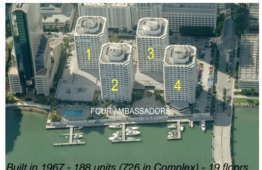
Built in 1967 - 188 units (726 in Complex) - 19 floors