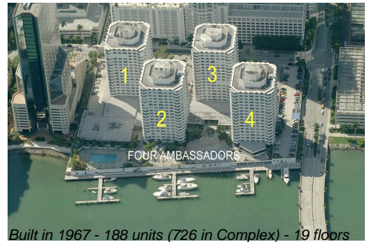
Built in 1967 - 188 units (726 in Complex) - 19 floors