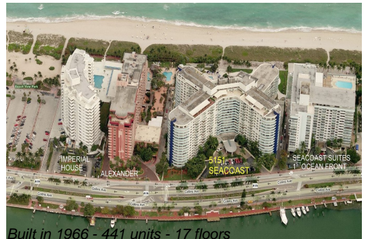
Built in 1966 - 441 units - 17 floors