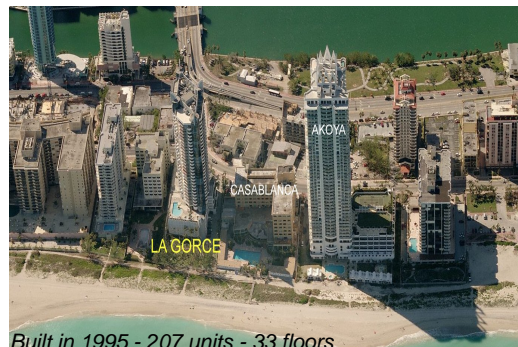
Built in 1995 - 207 units - 33 floors