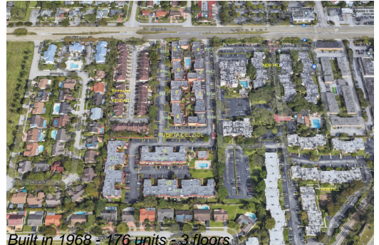
Built in 1968 - 176 units - 3 floors