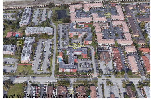
Built in 1984 - 80 units - 4 floors