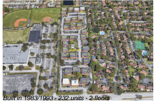
Built in 1983/1993 - 232 units - 2 floors