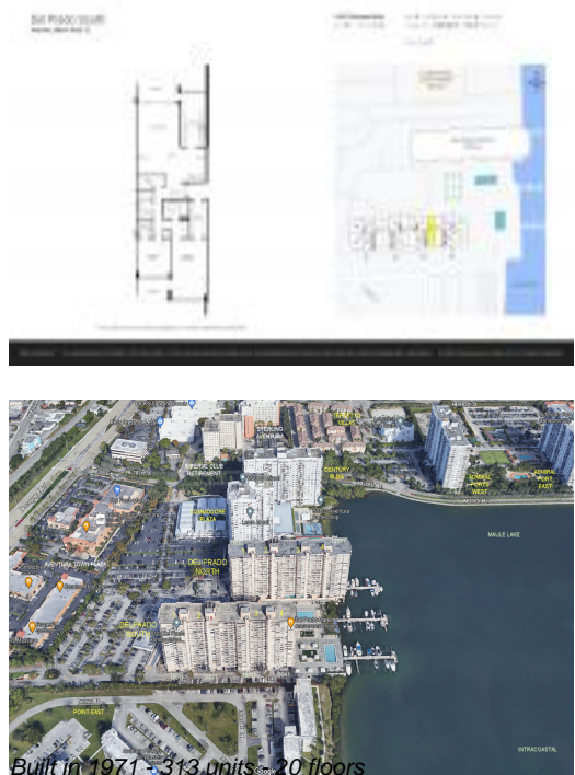
Built in 1971 - 313 units - 20 floors