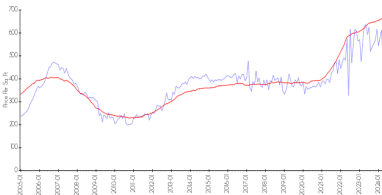
One Miami vs Miami