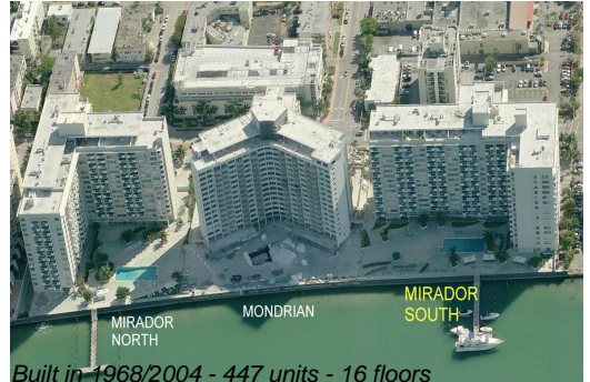
Built in 1968/2004 - 447 units - 16 floors