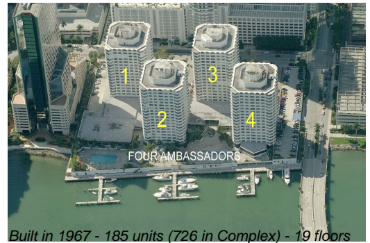
Built in 1967 - 185 units (726 in Complex) - 19 floors