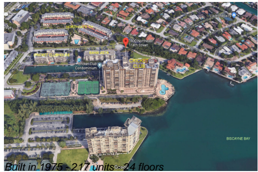
Built in 1975 - 217 units - 54 floors