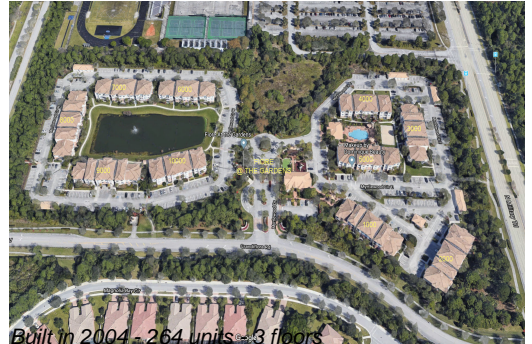
Built in 2004 - 264 units - 3 floors