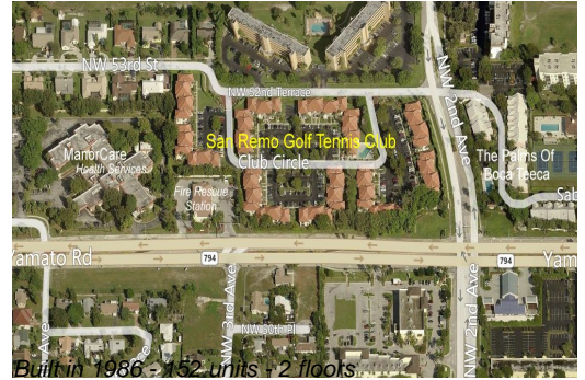
Built in 1986 - 152 units - 2 floors