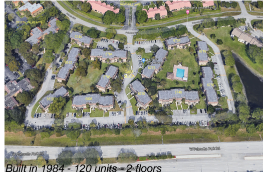
Built in 1984 - 120 units - 2 floors