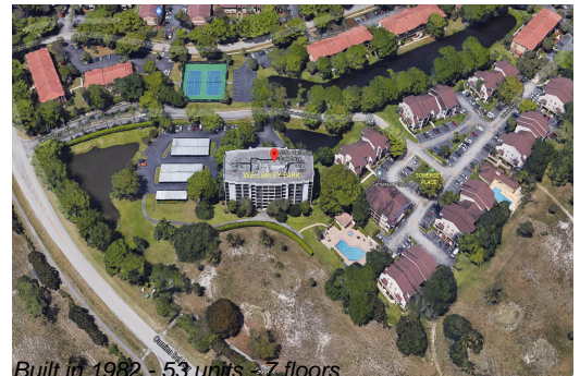
Built in 1982 - 53 units - 7 floors