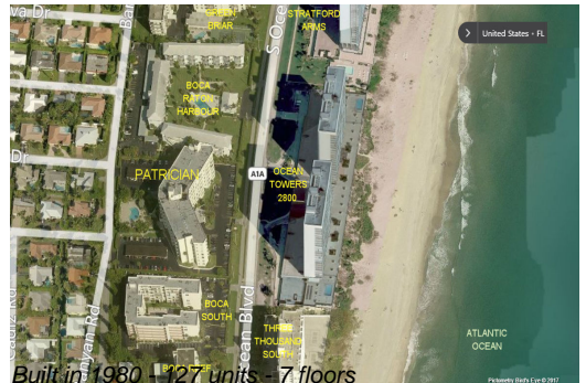
Built in 1980 - 127 units - 7 floors