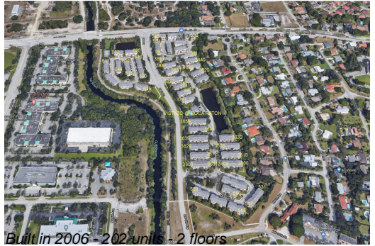
Built in 2006 - 202 units - 2 floors