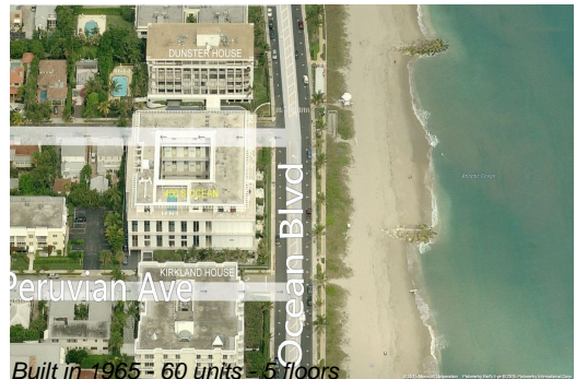
Built in 1965 - 60 units - 5 floors