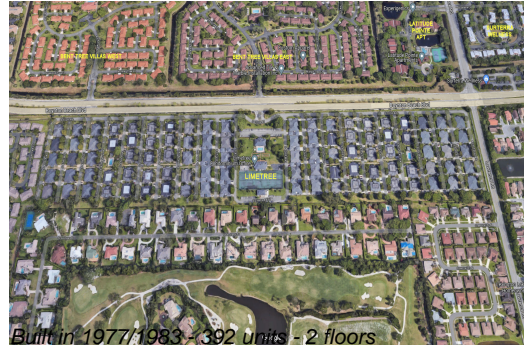
Built in 1977/1983 - 392 units - 2 floors