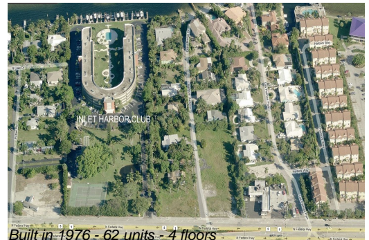
Built in 1976 - 62 units - 4 floors