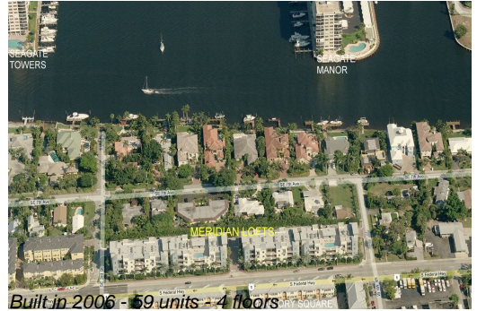
Built in 2006 - 59 units - 4 floors