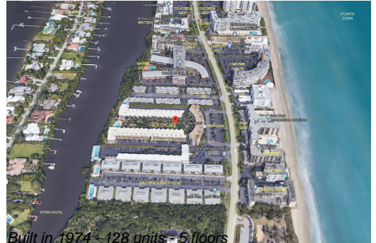
Built in 1974 - 128 units - 5 floors