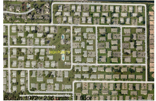
Built in 1972 - 236 units - 1 floor