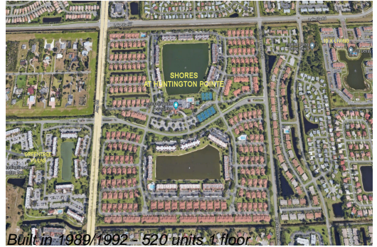
Built in: 1989/1992 - 520 units, 4 floor