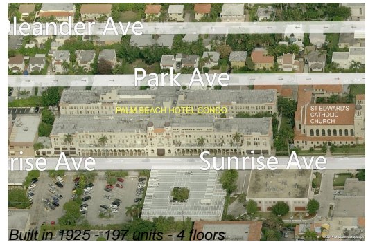
Built in 1925 - 197 units - 4 floors