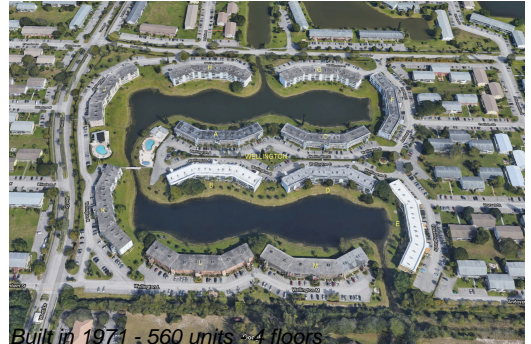
Built in 1971 - 560 units - 4 floors