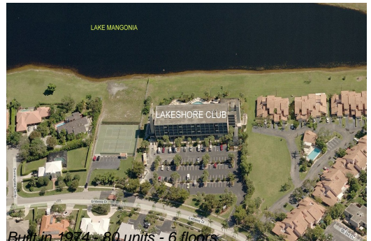
Built in 1974 - 80 units - 6 floors