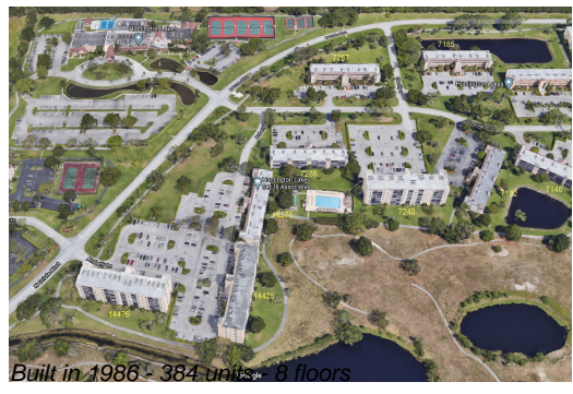
Built in 1986 - 384 units - 8 floors