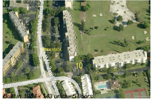
Built in 1984 - 143 units - 5 floors