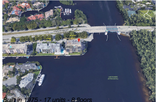
Built in 1975 - 17 units - 8 th floors